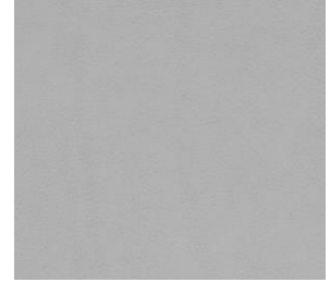
Light Grey 1302